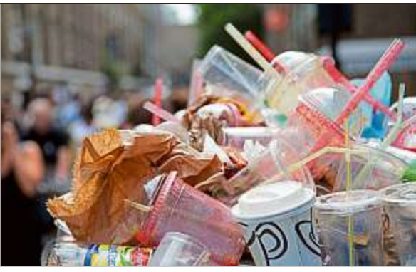
The raided shops will be served closure notices.

The chairman said the raids on shops in the organised sector will send a message to others.